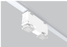
Mounting on trunking (Mounting brackets included)